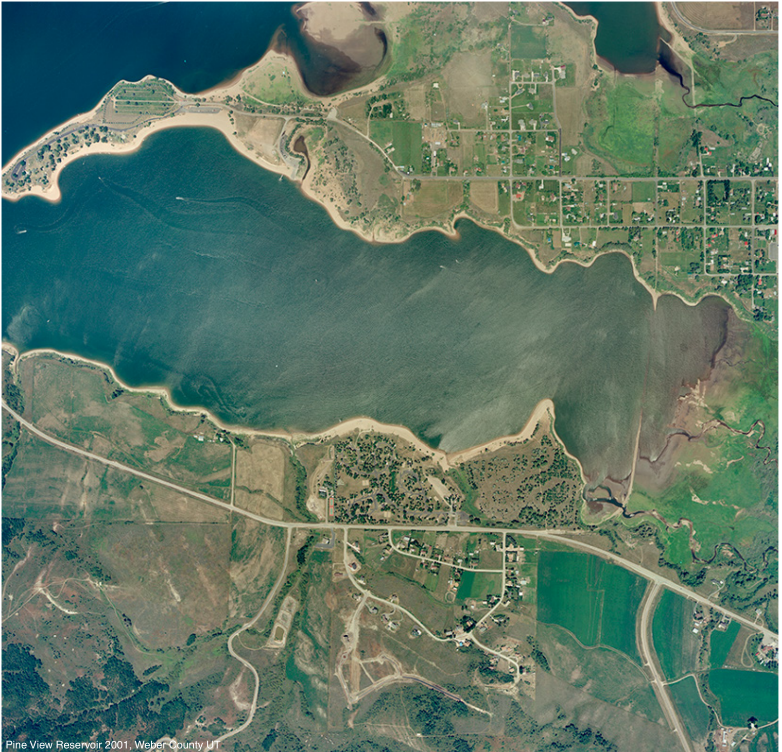
Pine View Reservoir 2001, Weber County UT

USDA/FPAC-BC/Geospatial Enterprise Operations | 125 South State Street, Ste. 6416 | Salt Lake City, Utah United States 84138 Phone: 801-844-2922 | geo.sales@usda.gov | www.fpacbc.usda.gov/geo